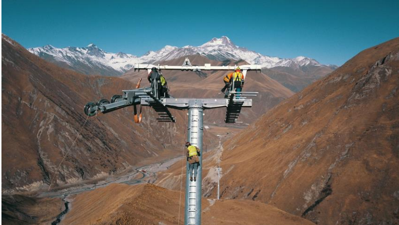
Kobi-Gudauri ski cable road - Length 7 km