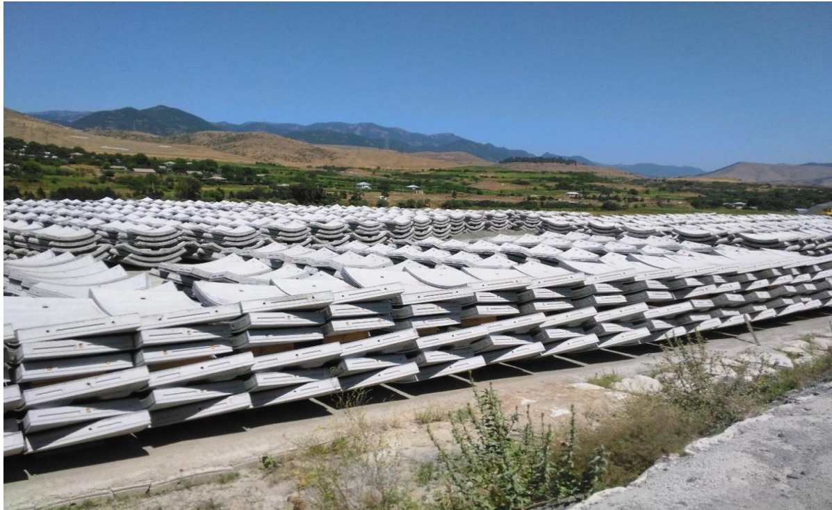
Water tunnel of Mtkvari HPP- Length 9.3 km