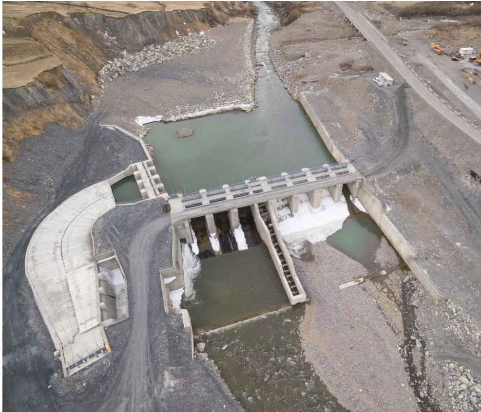
Dariali Hydropower Pant - Installed capacity 108 MW