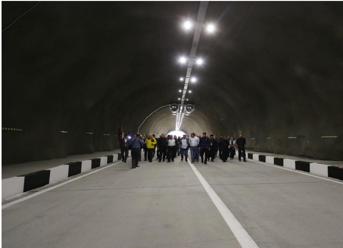
Larsi road tunnel - Length 1.7 km